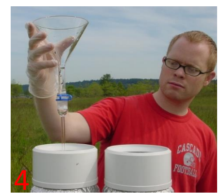
Remove used funnel and thistle tube. Remove blue clip. Re-bag glassware and place in MDN cooler.

Facing away from the collector, blow moisture from surface of sensor, allowing the collector to close. Remove bag from the funnel as the collector closes.