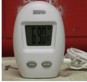
Record min/max temperatures in Block 9 of the field form.