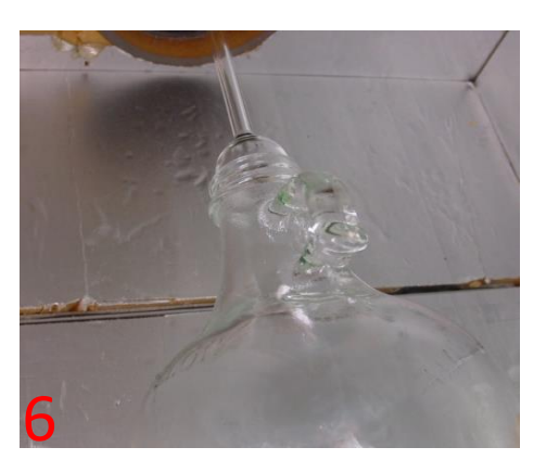
Wearing clean gloves, repeat steps 2 and 4 in reverse order to deploy new glassware. Ensure a good seal between the bulb and the bottle.