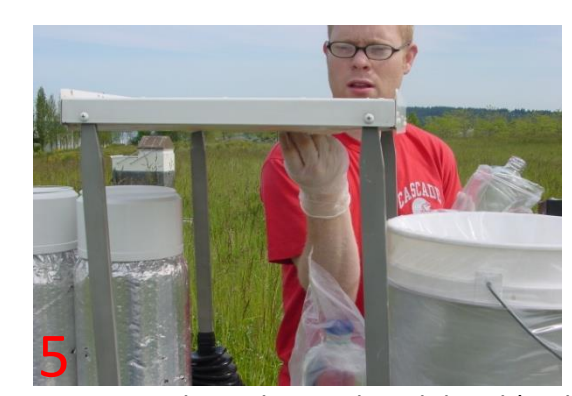
Wearing clean gloves, clean lid pad (with RO water) and collector surfaces (with 409). Replace dry-side bag.