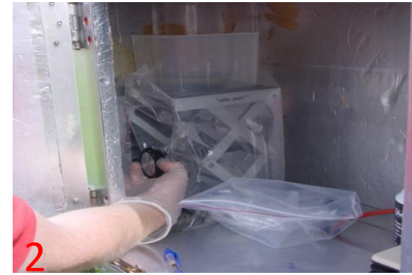
Lower jack. Wearing clean gloves, cap and bag the deployed sample bottle, and place in MDN cooler.

Ship the MDN cooler with sample and used glassware to the HAL for analysis.