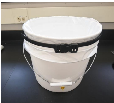
Figure 7. NTN bucket and sample bag ready for deployment.