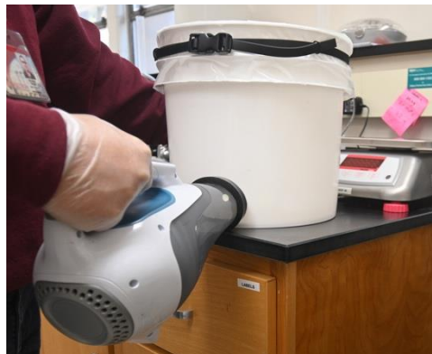
Figure 6. Apply the vacuum to pull the sample bag to the walls of the NTN bucket.