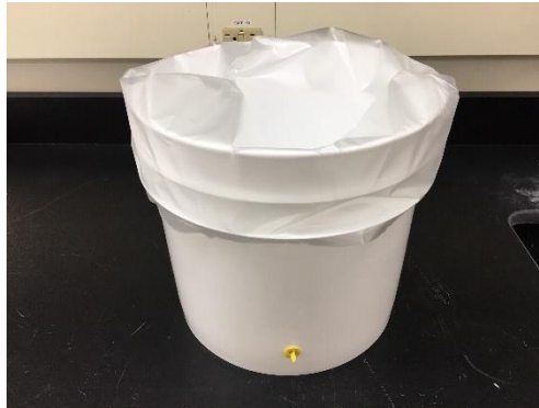
Figure 4. Drape excess sample bag over edge of NTN bucket.