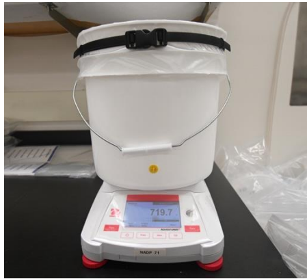
Figure 9. Weigh NTN bucket, sample bag, bucket strap and bucket plug