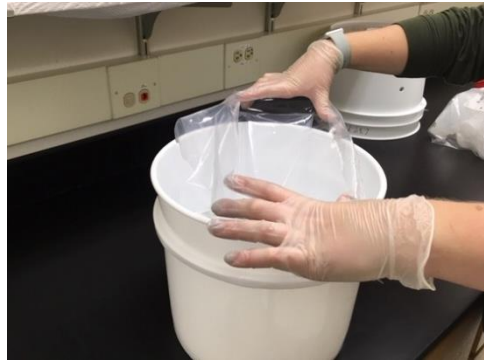
Figure 3. Open the sample bag starting at the top of the bag.