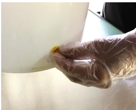
Figure 8. Insert bucket plug in the hole on side of NTN bucket to prevent water from entering.