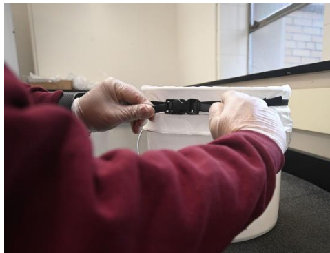
Figure 5. Wrap strap around NTN bucket and cinch to secure the sample bag.