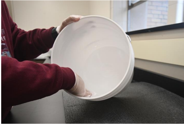
Figure 2. Cleaning sample bucket.