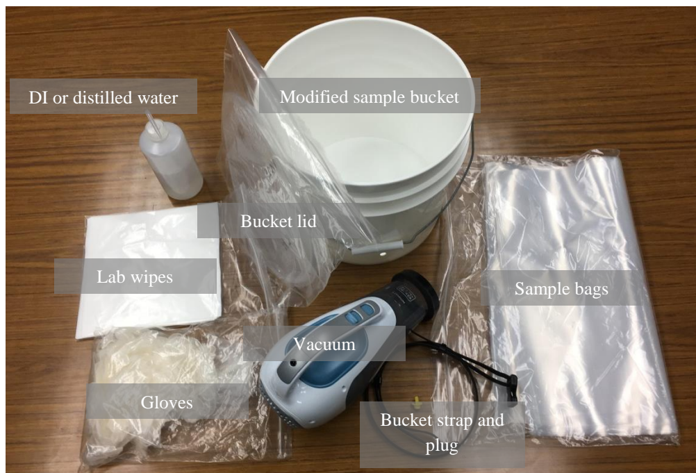
Figure 1. Items needed to deploy sampling bag.

Instructions – Sample Bag Preparation: Complete these steps before going to the field to deploy the new sample bucket.