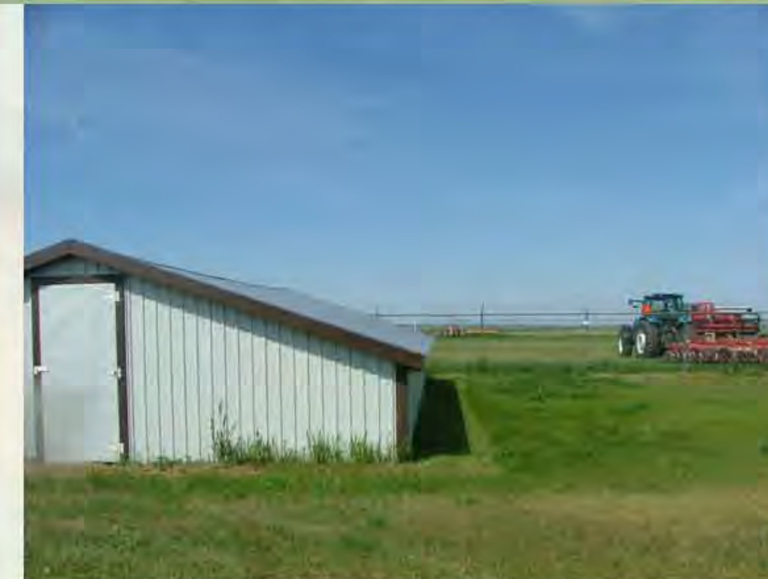
Figure 1. Covered shed erected in the 1950s at the South Farm of SPARC in Swift Current, SK.

STUDY SITE AND METHODS. In the 1950s, an area of 600 m 2 of agricultural land in southwest Saskatchewan (N50°15'35.6", W107°44'05.9") was protected from atmospheric input with the construction of a covered shed (Figure 1). This particular area is located at 825 m elevation within the semiarid climate of the brown soil zone of the Palliser Triangle—an agriculturally intensive area. In 2007, soil samples at two depths (i.e., 0-15 and 15-30 cm) were collected from both within the covered area and outside. Differences in heavy metal and metalloid concentrations in the soil (using ICP-MS) as well as soil characteristics were investigated.